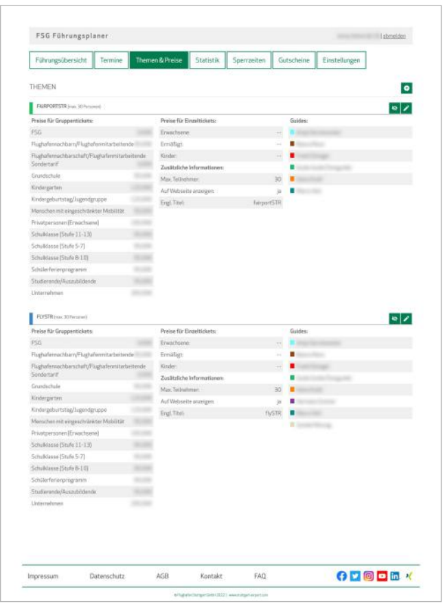
STR Airport: new admin view for topics and prices

The airport also planned to implement other functionalities down the line, such as different payment structures and ways to interface with Systems Applications and Products (SAP), so they needed an extensible system. Finally, the airport wanted the simplicity of a single system; too many different systems would be difficult for them to maintain.